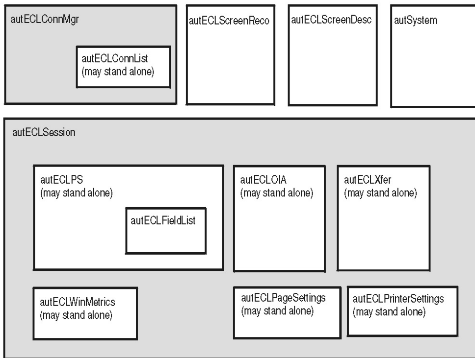
Figure 3. Host Access Class Library Automation Objects

Figure 3 is a graphical representation of the autECL objects: