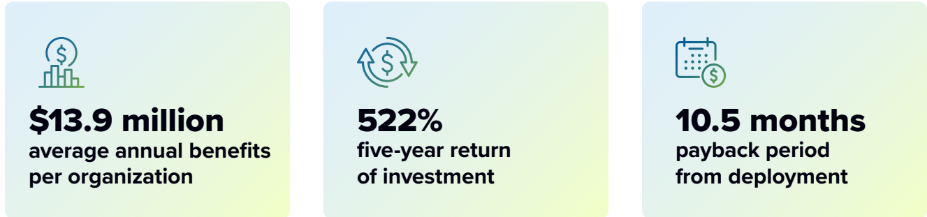
Average Annual Benefits per Organization: $13.9M