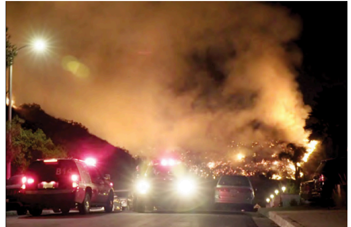
The Tubbs wildfire displaced thousands of Sonoma County residents, straining the County’s safety net system.

In the aftermath of the fire, many residents remained in the shelters and were vulnerable—needing food, clothing, shelter, employment and counseling among other things. But two weeks later, FEMA began to close the shelters before needs could be met for many individuals and families.