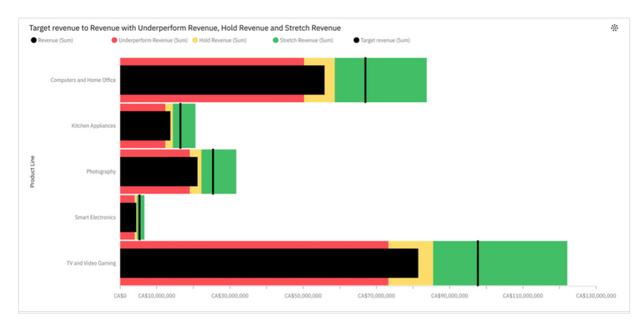
Figure 2. The new bullet chart helps compare performance metrics to other measures.