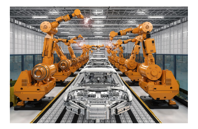
IBM's tools support automation of the creation and maintenance of relationships throughout the development lifecycle

the development lifecycle. The test case design-and-construction features support defining the overall design for each test case.