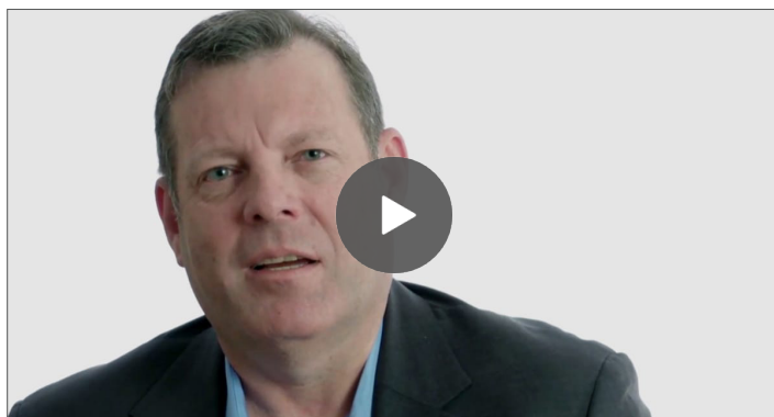
Manage hybrid IT with IBM Services for Multicloud Management

Effective IT management requires integration across your enterprise, and the right multicloud solution gives you a clear view of your apps, built-in support for your compliance management, and the simplicity and intelligence of automation.