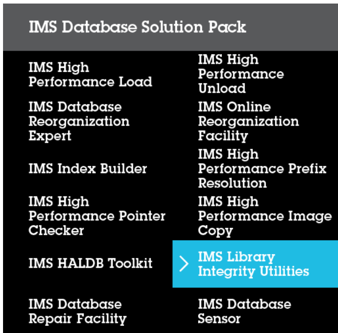
Figure 1: IMS Library Integrity Utilities in the IMS Database Solution Pack

The IMS Library Integrity Utilities are part of the IMS Database Solution Pack as shown in Figure 1. It is also a key component of the IMS Fast Path Solution Pack as shown in Figure 2.