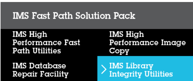
Figure 2: IMS Library Integrity Utilities in the IMS Fast Path Solution Pack

of database definitions, problems can occur that can result in data integrity issues. This is a common problem that can occur when a batch program uses a test DBD library to update a production IMS database. A similar problem can occur when a batch program uses a new DBD before the database was reorganized. The IMS system will not prevent these types of errors and IMS DBRC can not prevent them either. The IMS Library Integrity Utilities can catch these problems before they create serious data integrity problems in IMS production databases. The tool has the facilities to prevent both IMS batch and online applications problems by verifying the IMS control blocks during database authorization.