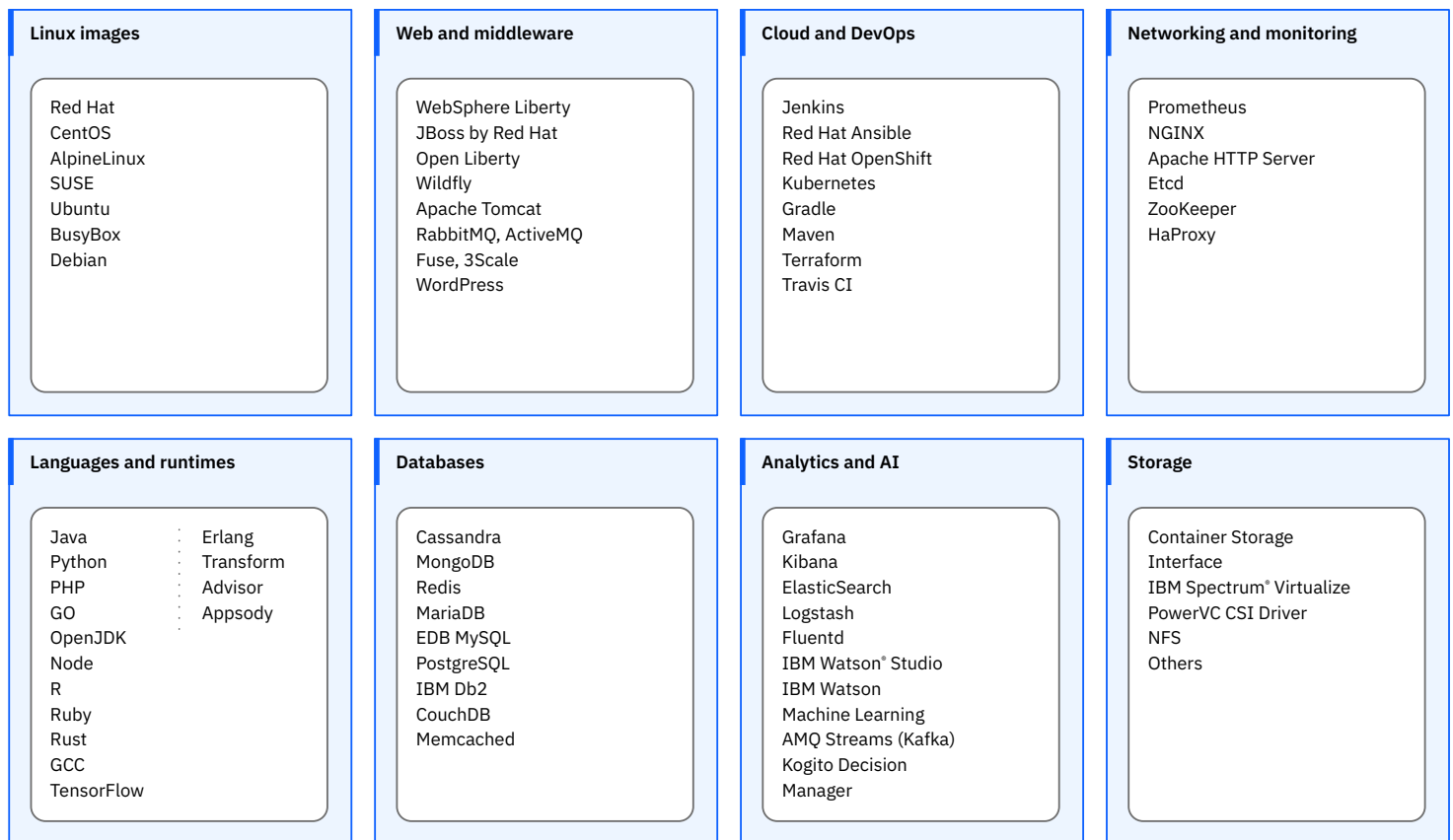
Figure 1. Extensive container software ecosystem on IBM Power (not intended to be exhaustive)

Take a guided tour of IBM Cloud Transformation Advisor →