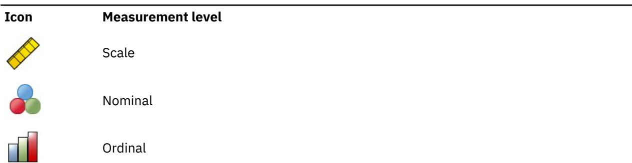
Table 1. Measurement level icons

You can temporarily change the measurement level for a variable by right-clicking the variable in the source variable list and selecting a measurement level from the pop-up menu.