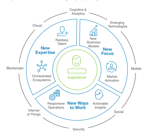
Figure 5 The Digital Reinvention framework combines the strengths of ecosystem partners

Healthcare organizations will also need to become ever-more proficient in digital technologies. They will, in fact, need to become digital leaders. Technologies will underpin any reinvention of healthcare, with the deeply intimate, individual experiences required. Rather than incrementalism, Digital Reinvention provides a path for the most visionary to adopt an experience-first planning approach, employing the strengths of both ecosystem partners and themselves (see Figure 5).