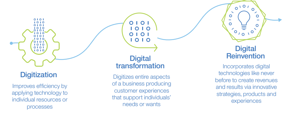
Figure 3 Digital Reinvention follows a path that starts with digitization and progresses through digital transformation

And when organizations are conceiving the healthcare ecosystems of the near future in a digitally reinvented world, they will find the possibilities limited only by their imaginations. For example, biological sensors that operate through the IoT to deliver real-time analytics and insight, and that are connected to Al-enabled systems, may help medical professionals provide vastly more precise advice and manage their activities and time optimally in real time. Personalized well-being management linked to personalized preventative and remedial treatment will not only extend lives, but dramatically reduce inefficiency and waste (see Figure 3).