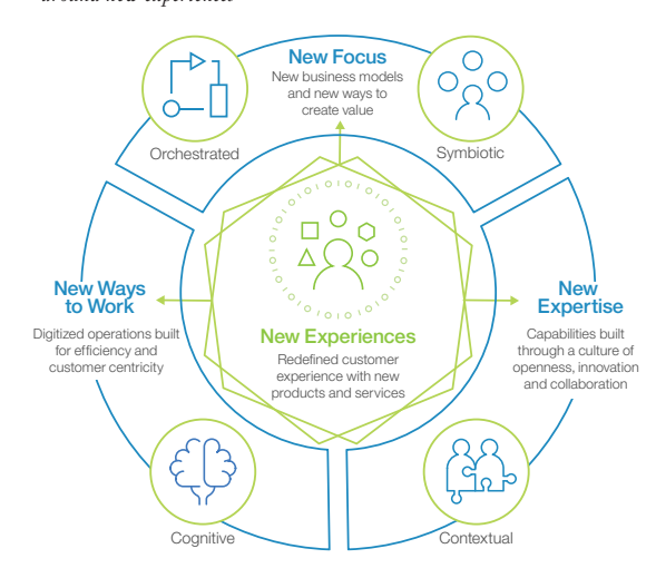
Figure 4 The Digital Reinvention operating environment revolves around new experiences

Healthcare organizations will need to deploy the technologies mentioned earlier in this paper quickly, as well as others that may not even be commercially available, to support scalable capabilities and interoperability. They will need to use digital tools to optimize existing operations and improve efficiencies, using any savings to fund further innovation.